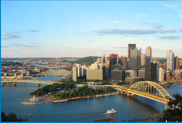
Pittsburgh Golden Triangle